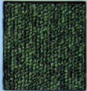
Mt. Olive Green