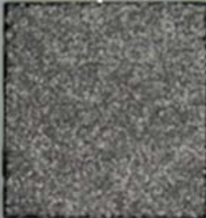
Grey Marsh Wood