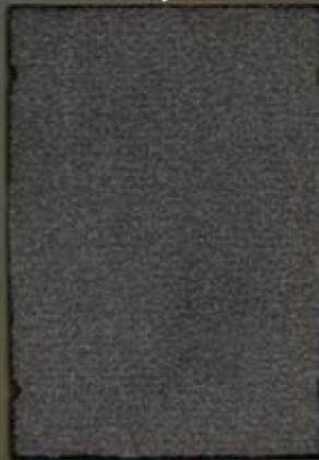
Grey Marsh Wood